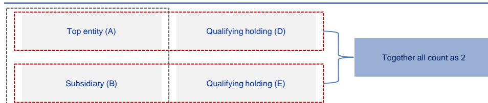
Figure 2 Counting of multiple directorships